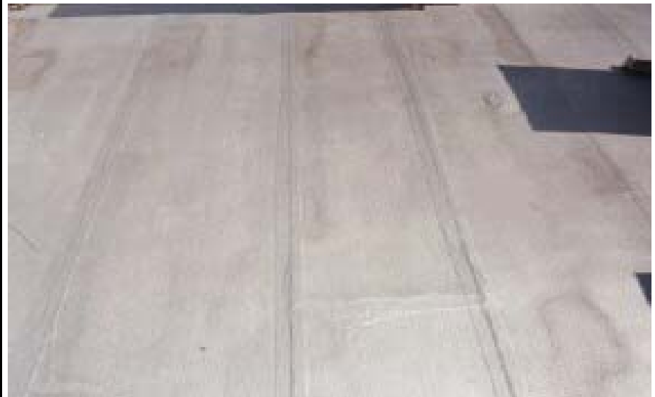
Two Years Old, Coated With Weather Barrier Moisture Cure Urethane. All Seams Were Taped For Additional Reinforcement . Weather Barrier OZ Catalyst Was Added To Resist Animal Fats.