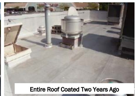
Entire Roof Coated Two Years Ago