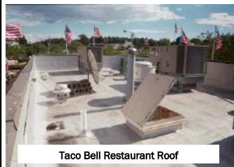
Taco Bell Restaurant Roof