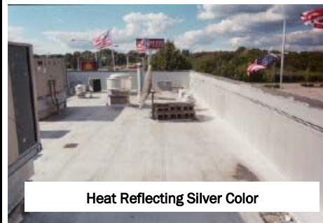
Heat Reflecting Silver Color